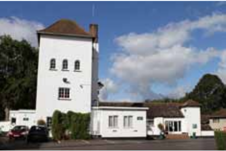
The current site